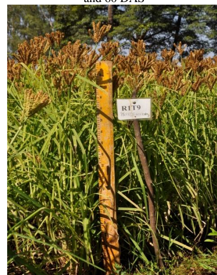
T 9 : 75% RDF fb 1% spray of KNO 3 at 45 and 60 DAS