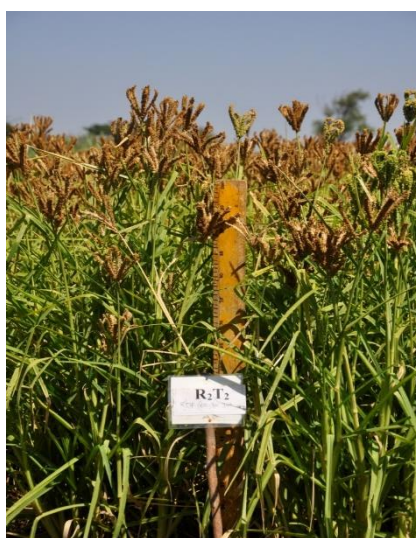
T 2 : 100% RDF (60:30:30 NPK kg ha -1 )