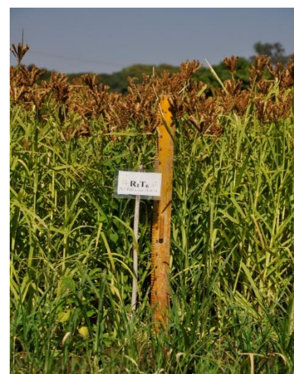
T 6 : 75% RDF fb 2% spray of 19:19:19 at 45 and 60 DAS