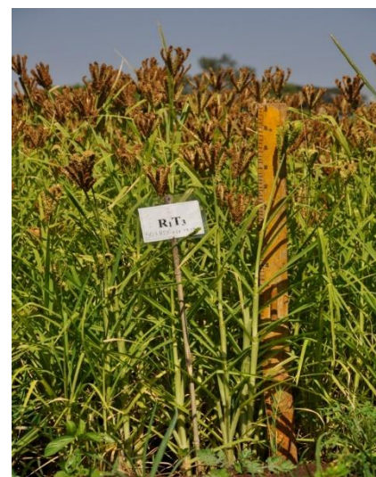
T3: 50% RDF fb 1% spray of 19:19:19 at 45 and 60 DAS