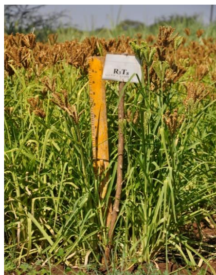
T8: 50% RDF fb 2% spray of KNO 3 at 45 and 60 DAS