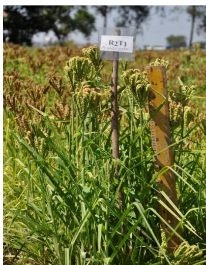
T 1 : Absolute Control