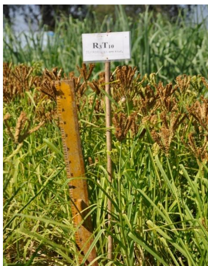
T 10 : 75% RDF fb 2% spray of KNO 3 at 45 and 60 DAS