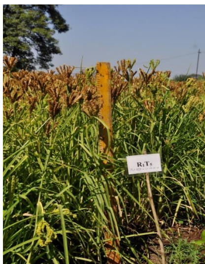
T 5 : 75% RDF fb 1% spray of 19:19:19 at 45 and 60 DAS