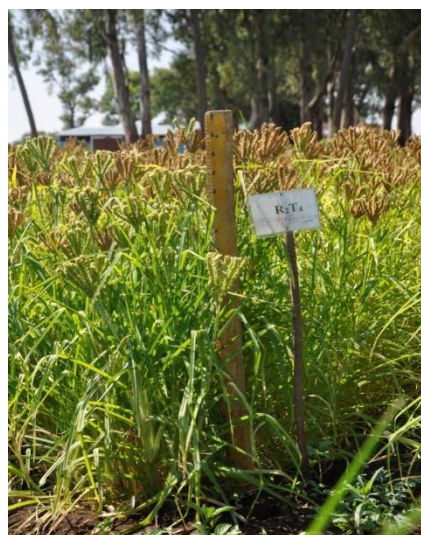
T4: 50% RDF fb 2% spray of 19:19:19 at 45 and 60 DAS